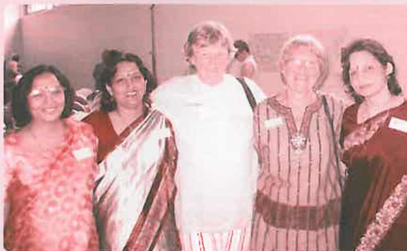
Swedish section welcomes the new Indian section in Kungälv