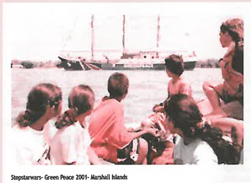
Stopstarwars- Green Peace 2001- Marshall Islands