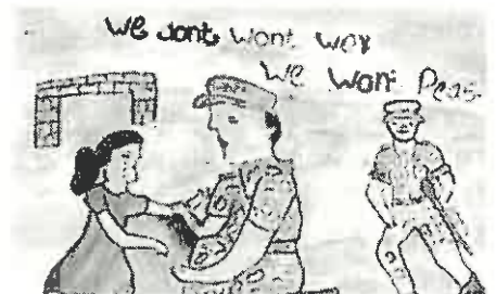
Picture by a girl in Yasodara Orphanage, Sri Lanka, home to over 60 girls. Many have lost their parents in the civil war, others have been brought there by mothers unable to care for them.