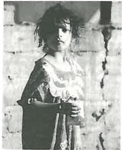
Girl aged before her time, Basra, Iraq.