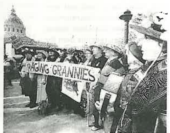
Raging Grannies San Francisco, February 2003.

"We welcome all participants and hand out copies of our songs asking them to join in." At their last performance, they had call and response, harmony and what ever style anyone wished. It is very