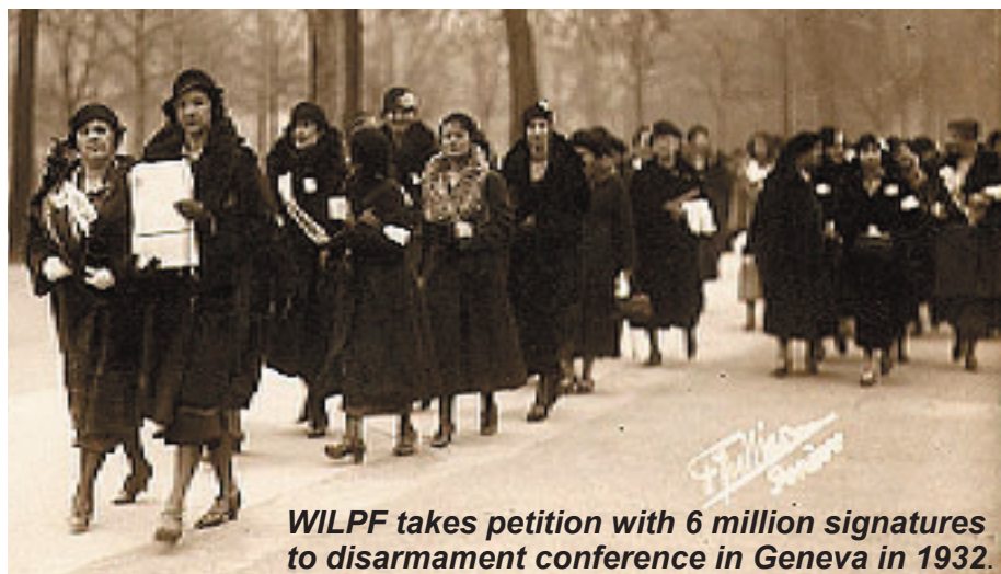
WILPF takes petition with 6 million signatures to disarmament conference in Geneva in 1932.